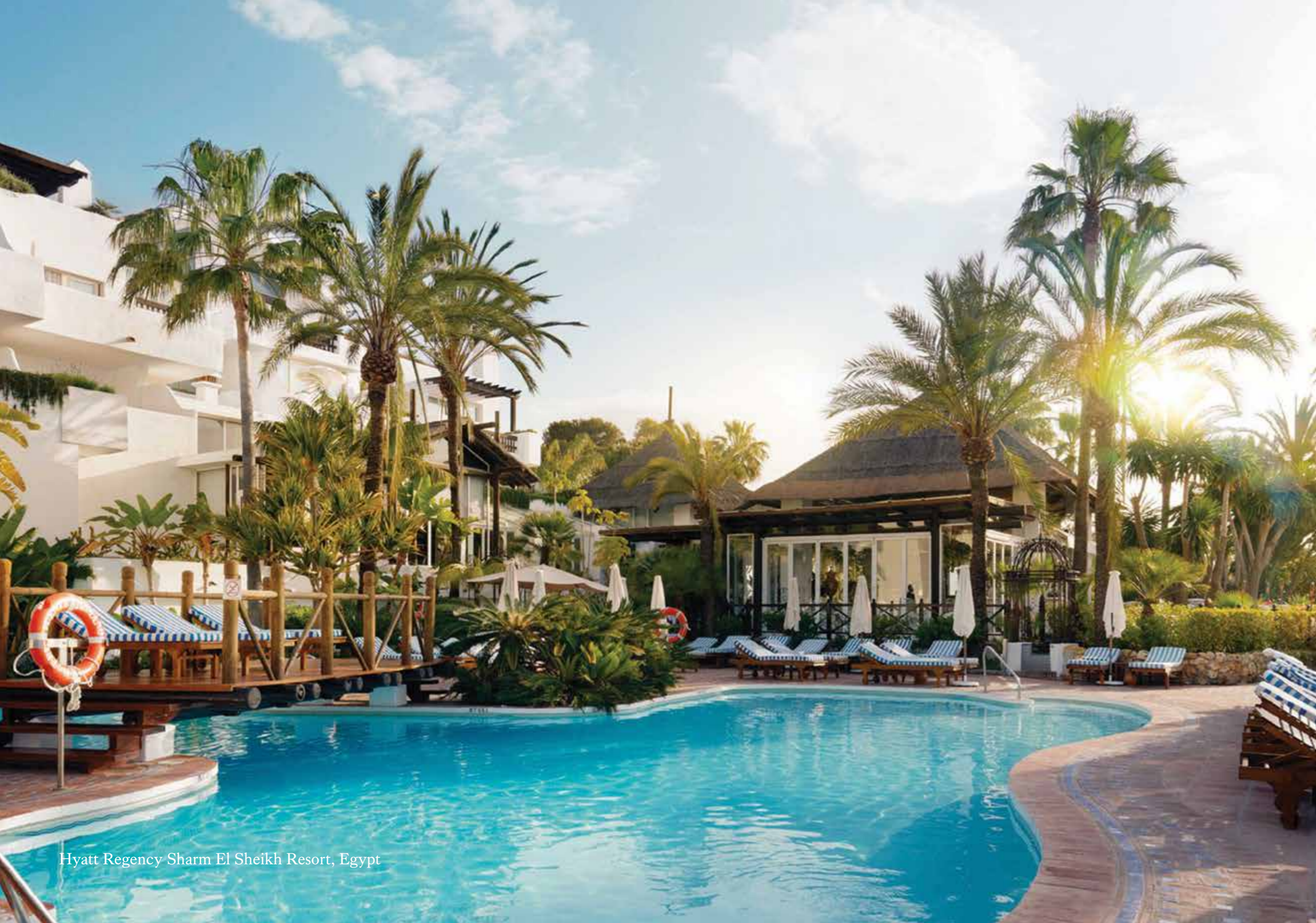
Hyatt Regency Sharm El Sheikh Resort, Egypt