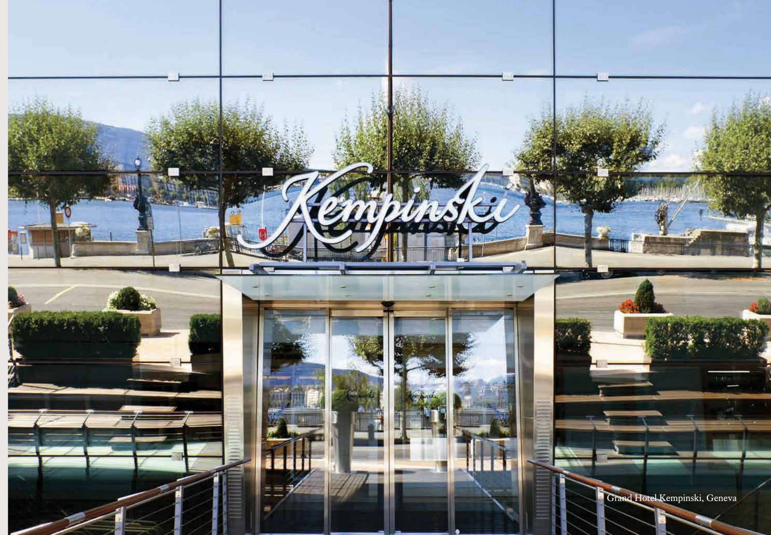
Grand Hotel Kempinski, Geneva

Range Developments has collaborated with the world's leading brands for the development of Cabrits Resort Kempinski, Dominica