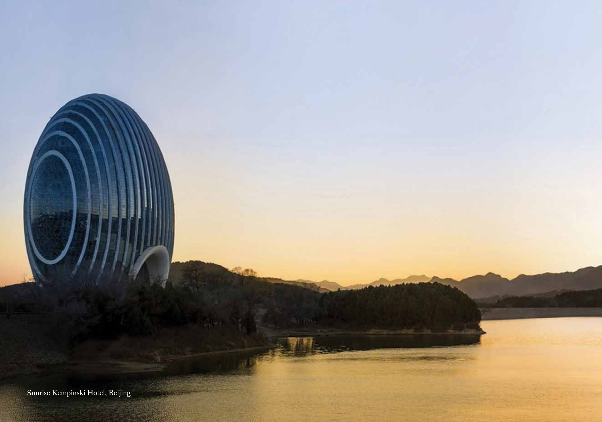
Sunrise Kempinski Hotel, Beijing