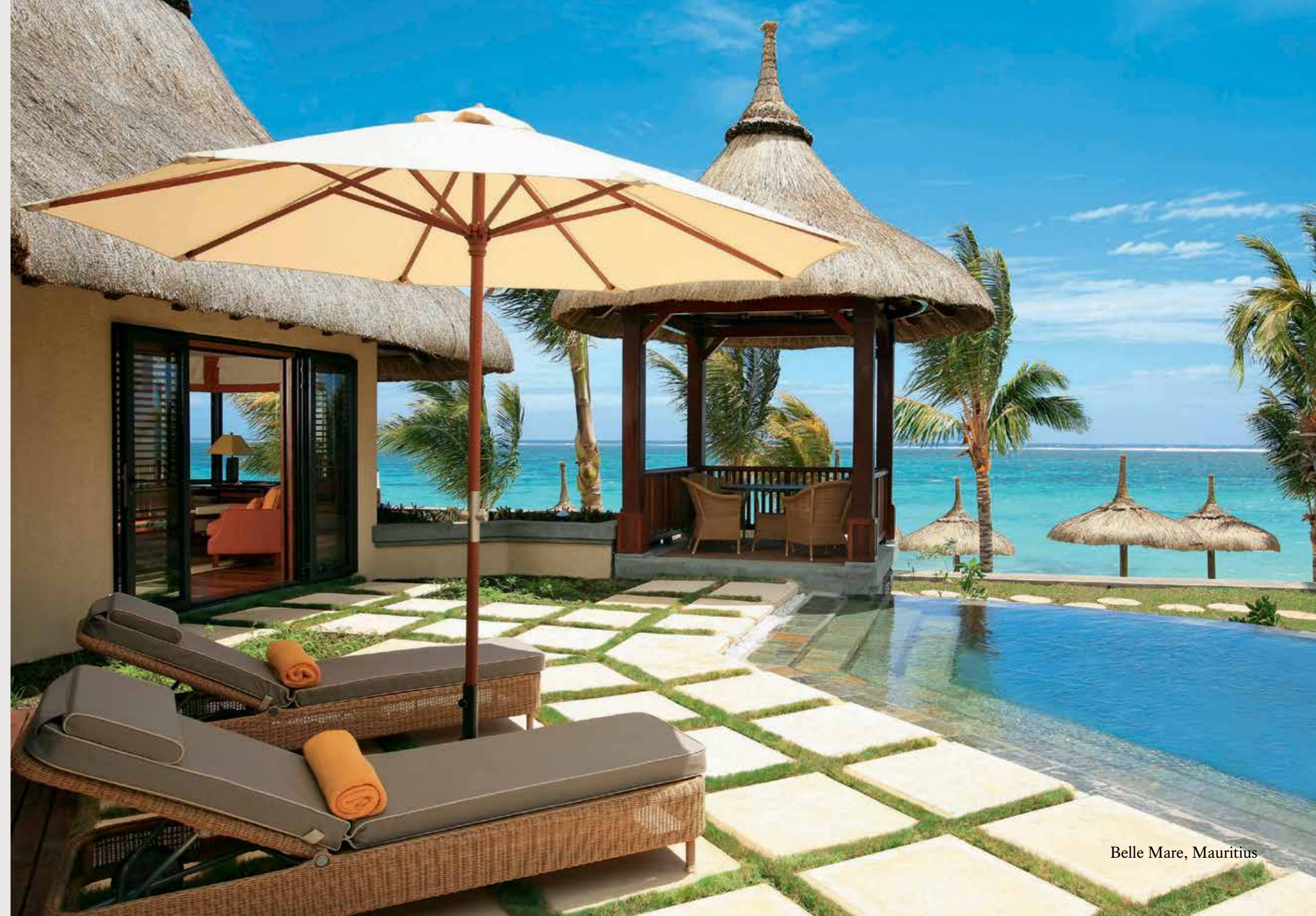
Belle Mare, Mauritius

Site Concepts International has worked with many of the world's top level hotel operators, including Kempinski, Hyatt International, Ritz-Carlton, and Marriott.