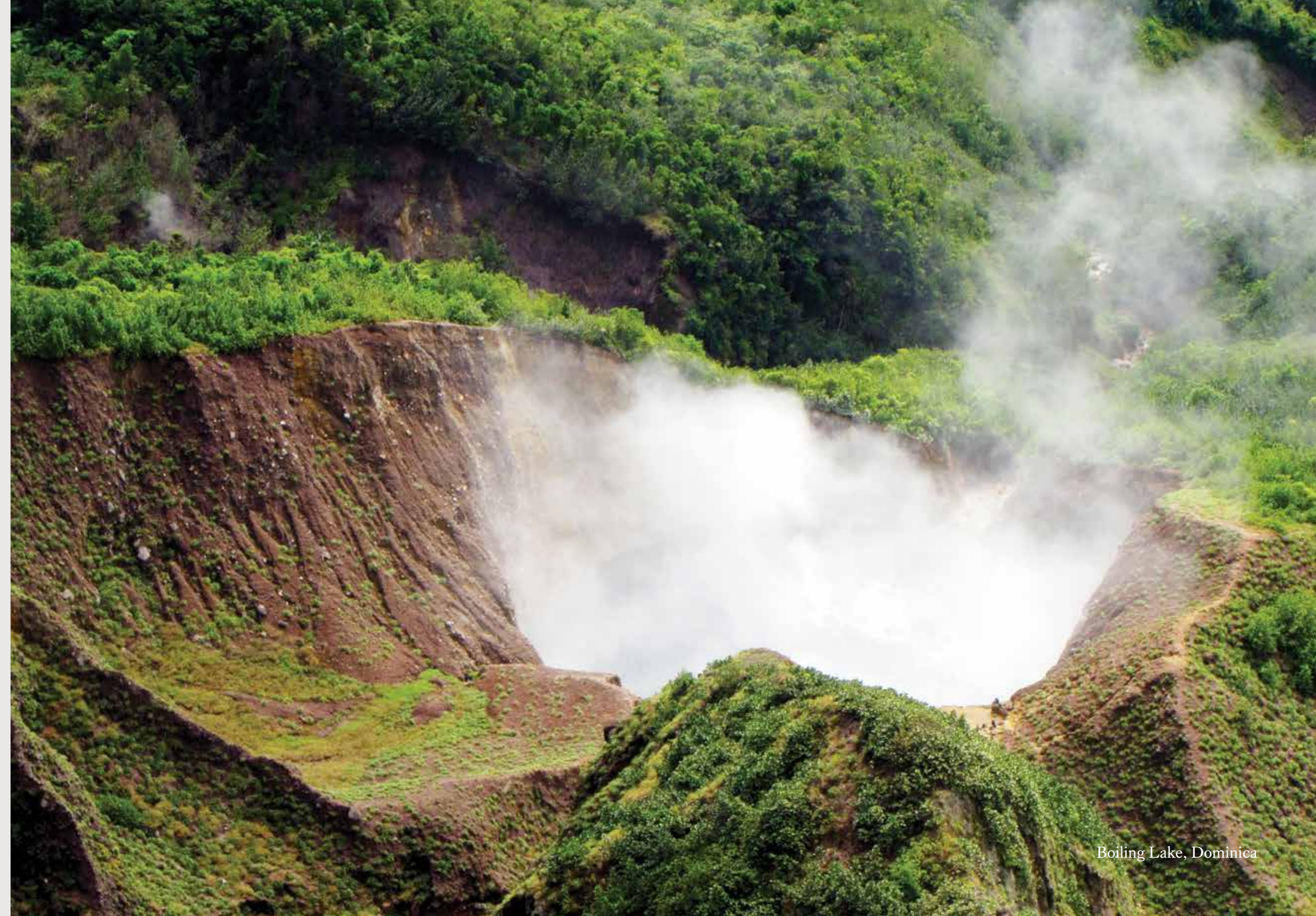
Boiling Lake, Dominica

Pristine waterfalls, deep gorges and volcanic bedrock canyons, brightly coloured sulfur springs, mini-geysers and bubbling mud pools – the island’s panoramic views are breath taking.